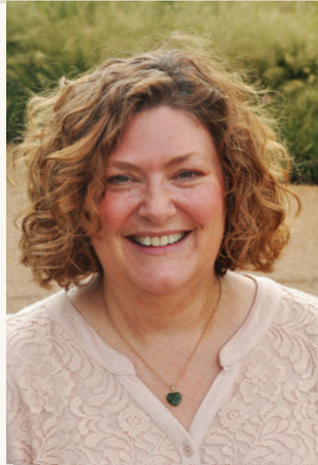
Counselor & Toastmaster

Brave Empathy – a groundbreaking guide to growing emotional fluency in leadership, parenting, and club communication