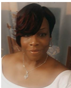
Division A Director