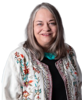
Division B Director