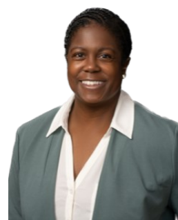
Division C Director