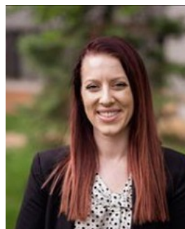
Division F Director