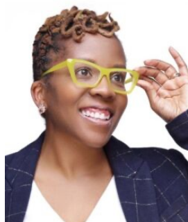
Division E Director