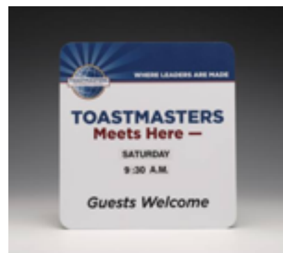
Figure 1—Club Meeting Plaque-384

improvements or enhancements could increase its effectiveness? Pavement signs can be placed outside your meeting room or in a busier area (outside the building near the street curb) to direct people to your club meeting/event. They are especially useful for club meeting locations that are set back from the road and not highly visible to those passing by. Something as easy as a change in placement, wording, lighting can make a difference. The POWER of FREE PRESS! #Signage