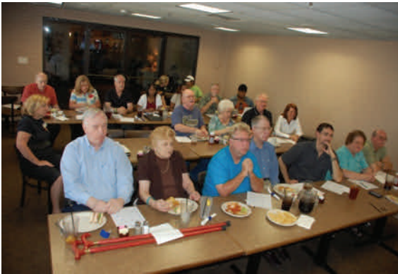
An ideal venue for this sort of get-together.

After it was all over and the winners were announced, it turned out that our judges agreed with the official judging. What fun! Here are some photos of the action: