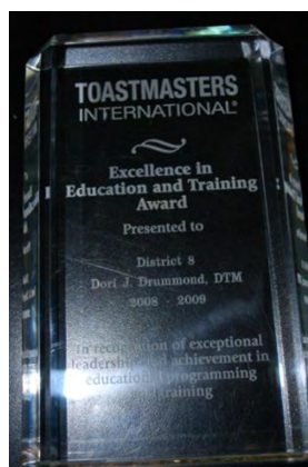
Excellence in Education & Training Award Presented to Dori Drummond, DTM 2008—2009