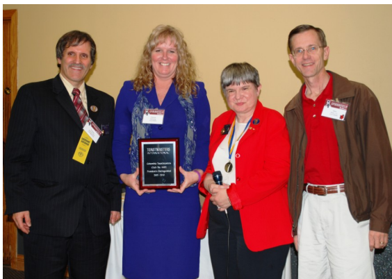
Columbia Toastmasters President's Distinguished 2001-2010