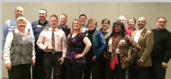
Club Growth Directors Group - Regions 4 & 5