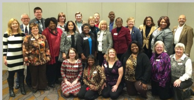
DDs- CGDs-PQDs Group - Regions 5