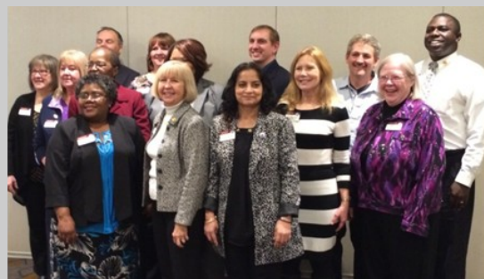
District Directors Group - Regions 4 & 5