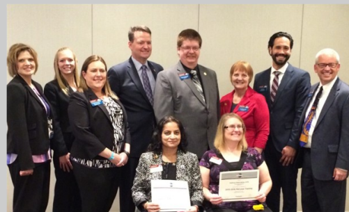
DD and CGD with TI Staff at Certificate Presentation

Enjoy images from District Leaders training! ♦