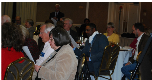
(Preparing to sing Friday night)